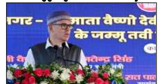
through rail," Abdullah said while addressing a gathering during the flagging-off of the Vande Bharat train from the Jammu railway station. Highlighting the railway

JAMMU, APR 30: Thanking Railways Minister Ashwini Vaishnaw and the Centre for extending Vande Bharat train services between Jammu and Srinagar, Chief Minister Omar Abdullah on Wednesday demanded a dry (inland) port for the union territory to boost trade and business. "I want to congratulate and thank Vaishnaw and government, on behalf of the people of Jammu and Kashmir, for connecting Jammu with Kashmir