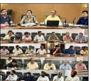
the New DC Office. Similarly, the Assistant Controller Drugs was directed to keep strict vigil on the sale of scheduled drugs and ensure compliance with all prescribed regulations. The meeting also reviewed the progress achieved in areas related to rehabilitation, lifestyle counselling, parent counselling during Parent-Teacher Meetings and advocacy campaigns aimed at creating awareness against drug abuse. Highlighting the role of social and religious institutions, the Deputy Commissioner called for roping in heads of religious institutions to motivate communities and reinforce moral responsibility in combating the drug menace.