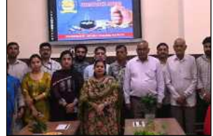
to stay focused on their academic and personal goals and to adopt a healthy lifestyle free from drugs and harmful substances. The programme witnessed active engagement from both parents and students, who expressed their views and sought guidance on tackling such issues effectively. Students were encouraged