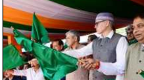
ly flagged off by Railway Minister Ashwini Vaishnaw, Union Minister of State Dr. Jitendra Singh, and Chief Minister Omar Abdullah, reaffirming the Government of India's