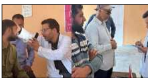
by a team of doctors deputised by the Health Department, including a General Physician and an Ophthalmologist. The medical examination focused on overall physical fitness, vision assessment and other health parameters essential for safe driving. The programme also formed part of the ongoing 100-Day Nasha Mukt Jammu & Kashmir Abhiyan, being actively implemented across the district to create awareness against substance abuse

RAMBAN, APRIL 30: In a significant initiative aimed at promoting the health and well-being of the transport fraternity, the Motor Vehicles Department (MVD) Ramban, in coordination with the Health Department, today organized a free medical health check-up camp for drivers, conductors and other members of the transport operators here at the Community Hall. The camp was organized in line with the directives of Deputy Commissioner Mohammad Alyas Khan to promote physical fitness and health awareness among the transport workers, who play a vital role in public transportation and road safety. More than 100 drivers and conductors participated in the camp and underwent comprehensive health screening conducted