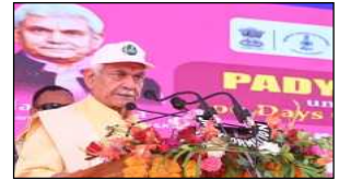
ism, and those involved will get stringent punishment. I feel drug abuse is like silent terrorism, not just a matter of law and order," he said. Likening narcotics smuggling to "terrorism in disguise", Sinha called it a hidden threat that devastates the

JAMMU, APR 30: Jammu and Kashmir Lieutenant Governor Manoj Sinha on Thursday said that drug traffickers would be dealt with like terrorists under the law in the Union territory, where 440 drug offenders have been arrested and 350 FIRs filed in the past 20 days under the 100-day 'Nasha Mukti J-K Abhiyan'. Addressing a gathering after launching the anti-drug campaign in Doda, Sinha termed drug abuse a form of "silent terrorism" and called for a public movement against the menace. "Narcotics smuggling is no less than terrorism, and those involved will get stringent punishment. I feel drug abuse is like silent terrorism, not just a matter of law and order," he said. Likening narcotics smuggling to "terrorism in disguise", Sinha called it a hidden threat that devastates the