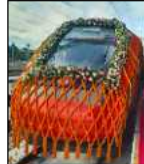
They were formally inaugurated by Jammu Tawi and Srinagar

JAMMU, APRIL 30: A historic milestone was achieved today in Jammu and Kashmir's transport infrastructure as the direct high-speed Vande Bharat Express service between Jammu Tawi and Srinagar