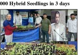
the sale of approximately 72,000 seedlings. Hybrid seedlings of brinjal, tomato and marigold flowers were made available to farmers at highly affordable prices through two designated sale counters-one at the AEO Office and another at the New DC Office. Farmers from various parts of the district availed themselves of the opportunity to procure high-quality planting material aimed at boosting crop productivity and improving economic returns.

KISHTWAR, APRIL 30: In a major push towards strengthening vegetable cultivation and enhancing farmers' income, the Department of Agriculture Kishtwar today concluded a 3 day sale and distribution drive of hybrid seedlings in the district. The initiative was carried out under the directions of Deputy Commissioner Pankaj Kumar Sharma and under the guidance of Chief Agriculture Officer (CAO) Kushal Chandel. The three-day distribution drive, conducted from April 28 to April 30, witnessed an overwhelming response from the farming community, culminating in