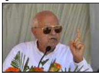
rekindling brotherhood in the region. However, it also brought the people of Jammu and Kashmir on the streets in protest. This was, Abdullah said, a clear signal to Pakistan that terror was being rejected. The pain was not felt only by the families who lost their dear ones but also by the people of Jammu and

SRINAGAR, APR 30: Asserting that "enough is enough", National Conference president Farooq Abdullah says Pakistan should "call it a day" and end the cycle of violence in Jammu and Kashmir. While terrorism has largely subsided, Pakistan's refusal to accept Jammu and Kashmir as an integral part of India continues to fuel violence in the region, the three-time Jammu and Kashmir chief minister said. "My humble advice to both these nations, my own nation and Pakistan, is that the time has come. Let us leave the path of violence and start finding ways of peace so that we can live with honour and dignity," the 88-year-old said in an interview. Discussing the Pahalgam terror attack, in which 26 people were killed, he said it was a "big blow" to efforts of